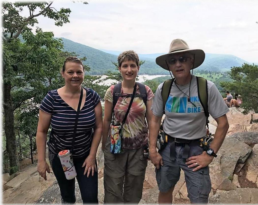
2017: Weverton Cliffs, Washington County