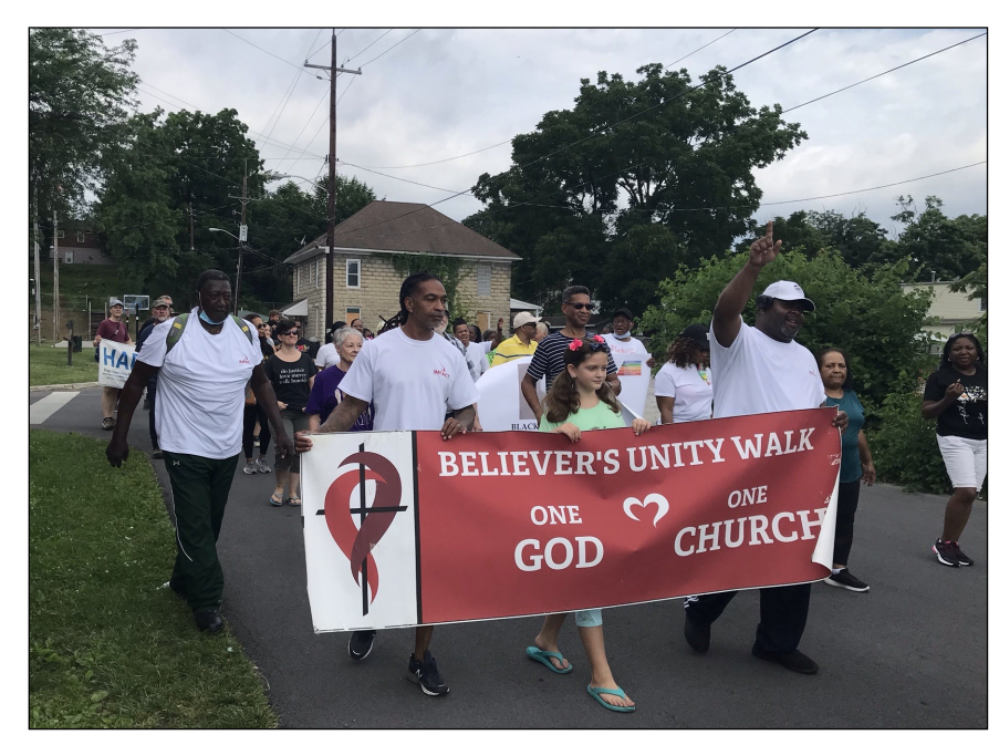
Juneteenth Unity Walk in Hagerstown.

with Washington County Public Schools personnel — Racial Justice Team members have met