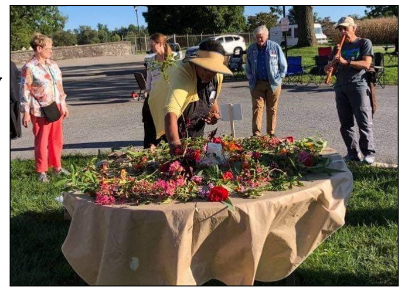
The Interfaith Coalition celebrated the International Day of World Peace in September.

In September, an in-person outdoor celebration of the International Day of World Peace was held. Interfaith music was provided, car trunks were decorated in tribute to the idea that Interfaith connections encourage acceptance. The event closed with the creation of a flower mandala, prayer and an interfaith blessing.