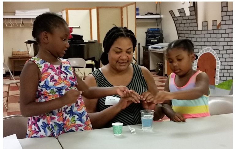
Learning Parties engage children and their families in the fun of learning.

■ Distributed Summer Learning Kits to 100 families. Each included five books, cards and puzzles, markers, crayons, craft materials, and activities sheets.