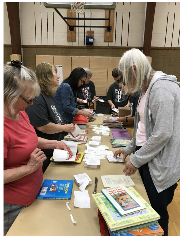
Volunteers sort books donated to the Community Book Drive.

Books are distributed to vulnerable children through the new Community Book Warehouse , where organizations and schools serving children in need and individuals can go to get books each month. Over the past eight years, the book drive has collected and distributed more than 100,000 books for children’s literacy efforts.