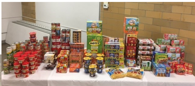
Above: Food collected for Micah's Backpack by MCI-H employees.