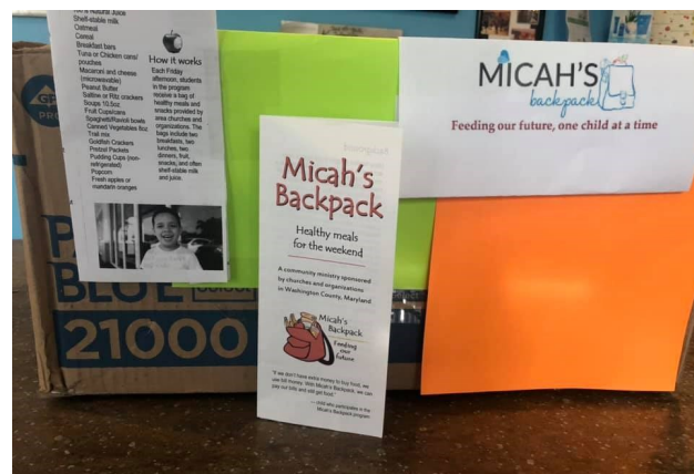
A food collection box at Fit in Boonsboro.