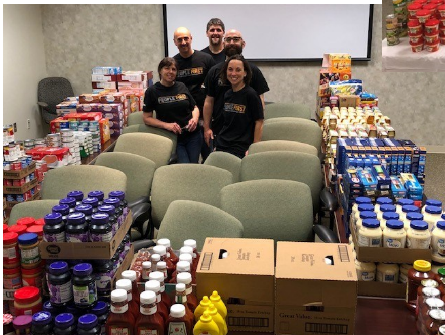
Left: Employees from JLG-Jerr Dan in Hagerstown collect and sort food for Micah's Backpack.